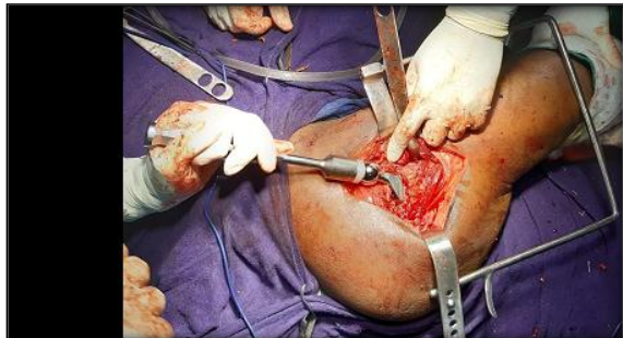
Figure 8: Prosthesis insertion

generally acceptable to recreate the desired normal anatomy, that is approximately 15 degrees of acetabular version and 5-10 degrees of femoral anteversion. [Figure 8] When proper soft tissue tension is achieved, the stability of the joint can be demonstrated on flexion, adduction and internal rotation.