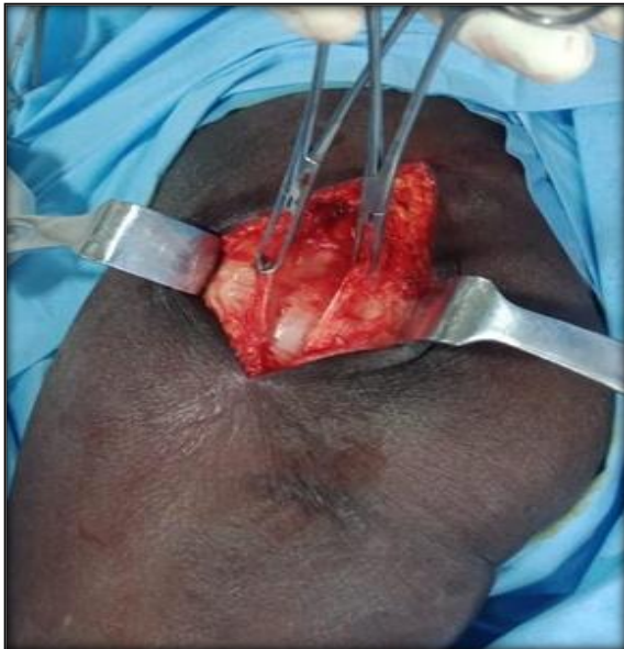
Figure 2: Fascia lata incision

The trochanteric bursa is incised, anterior and posterior borders of the Gluteus Medius and the Vastuslateralis are identified.