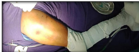
Figure 1: Positioning of the patient

The patient is placed in the full lateral position on the operating table, one posterior post is placed just above the natal cleft and one against Pubic symphysis. [Figure 1]