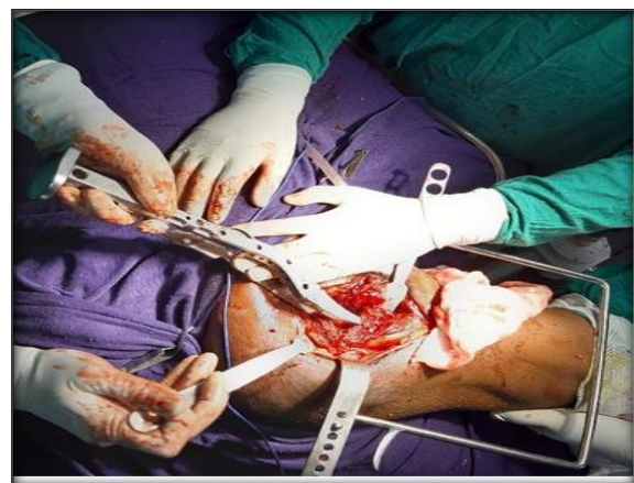
Figure 7: Femoral canal preparation

Final implantation done after trial prosthesis was found to be stable and satisfactory.