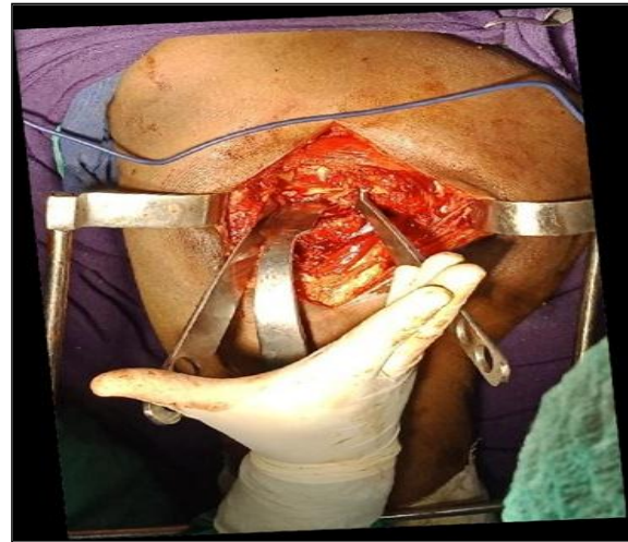
Figure 6: Acetabular exposure

The capsule is retained and is retracted using a self retaining retractor with one limb over the anterior capsule and the other over the trochanter, if the approach was not adequate an additional.