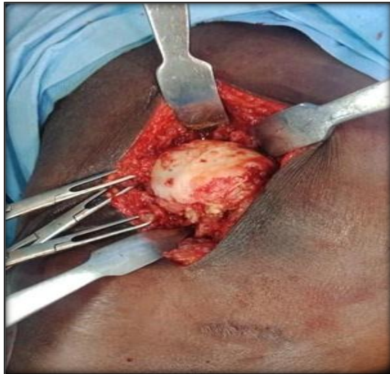
Figure 5: Dislocation of the joint

At this stage the head of the femur is dislocated by flexion, adduction and external rotation. (Fig 16) The leg is then brought into sterile pouch to perform a femoral neck osteotomy (A corkscrew is used to deliver the head or neck osteotomised).