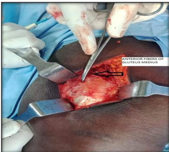
Figure 3: Anterior border of Gluteus Medius

Deep blunt retractors are used to separate the muscle fibers of the gluteus medius at its anterior middle one-third junction, usually a layer of fat is visible deep to gluteus medius, this split is in the direction of the muscle fibers which makes anterior 45 degrees angulation to the skin incision, the split is not extended more than 3 cm cephalad to its insertion to protect the inferior branch of superior gluteal nerve. [Figure 3]